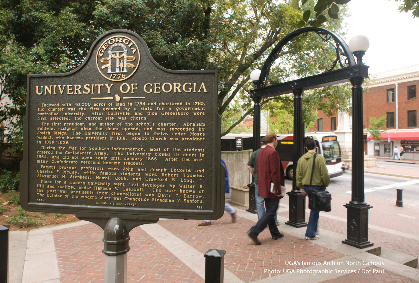
UGA's famous Arch on North Campus