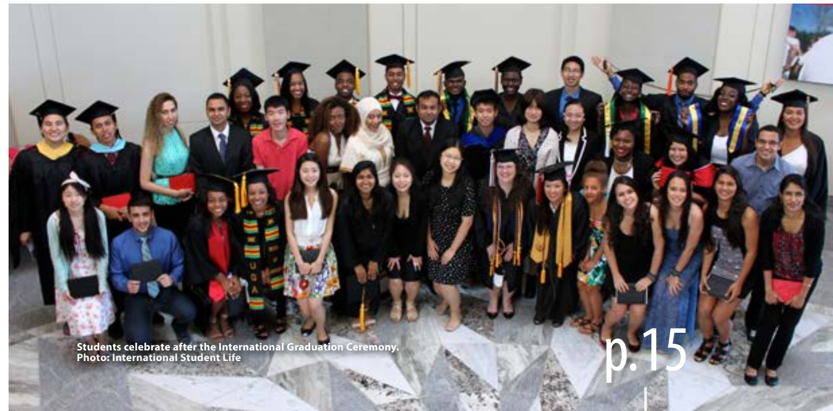
Students celebrate after the International Graduation Ceremony.

All exchange students who finish their exchange program at the University of Georgia during the spring semester qualify to participate in the International Graduation Ceremony and receive a study abroad certificate. The International Graduation Ceremony highlights the special accomplishments and sacrifices made by international students and their families, and includes a complimentary reception immediately following for graduates and their guests. Questions about the ceremony can be forwarded to isl@uga.edu .