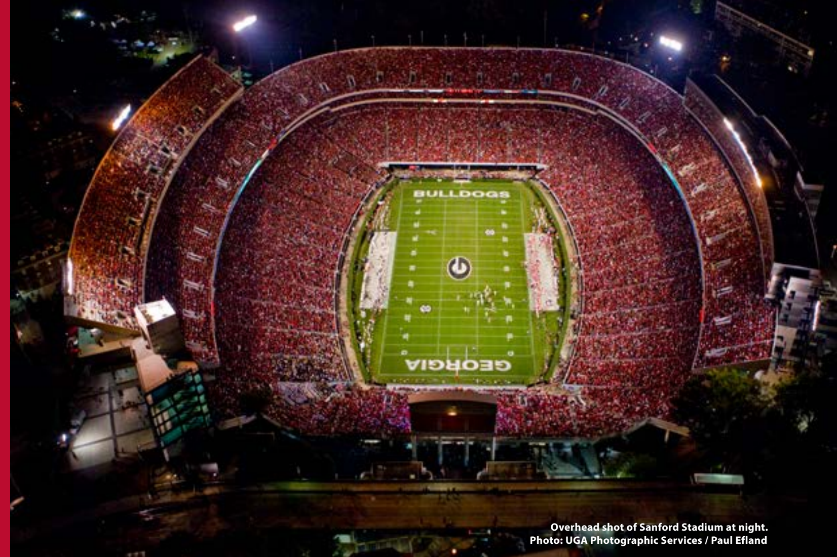
Overhead shot of Sanford Stadium at night.