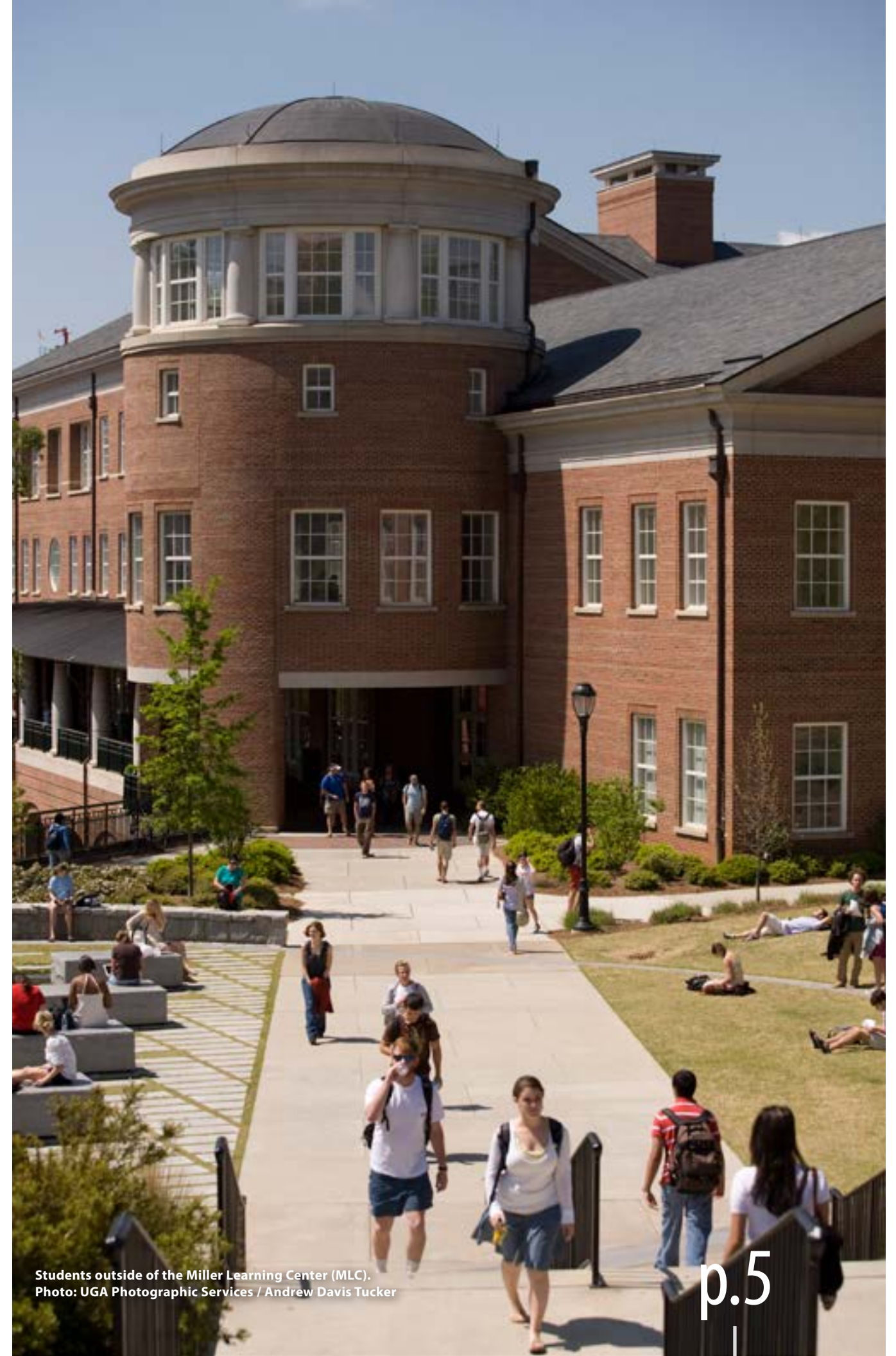
Students outside of the Miller Learning Center (MLC).